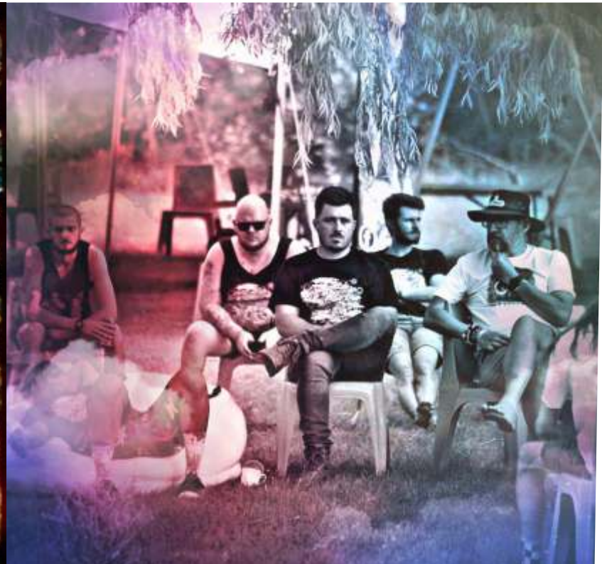
...continued from page 7

The GOA responsible adult use model is systematising at an accelerated pace for the onlooker and this gathering in the South had primarily a core mandate as to plan and to prepare for the coming year in terms of growth strategies addressing business challenges and all things cannabis.