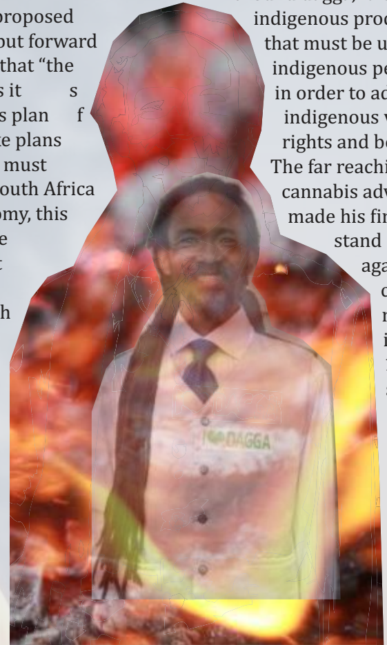
cold truth that...

around dagga, it is an indigenous product that must be used by indigenous people in order to advance indigenous values rights and beliefs" The far reaching cannabis advocate made his first stand against cannab regulation in 1998 shovel ed out more oals how be it o warm he istene s with he