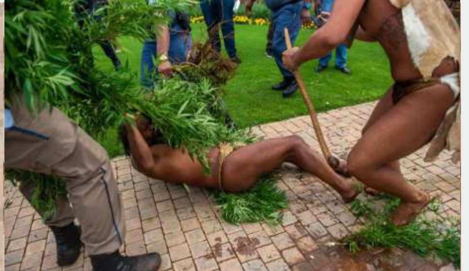
King Khoisan SA Dragged by Police Officials