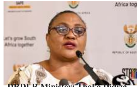
DRDLR Minister: Thoko Didiza

A call is thus made to all interested growers, researchers, processors and manufacturers to apply for hemp permits. Application forms, guidelines, requirements and guidelines are accessible on the department's website, www.dalrrd.gov.za . Follow the Plant Production link.